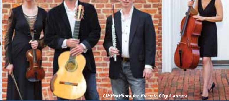
OEProPhoto for Electric City Couture