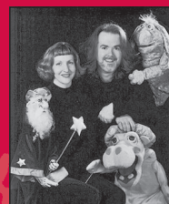
The Puppet People